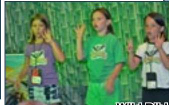
Wild Bible Adventures