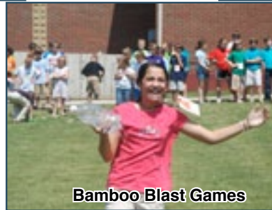
Bamboo Blast Games